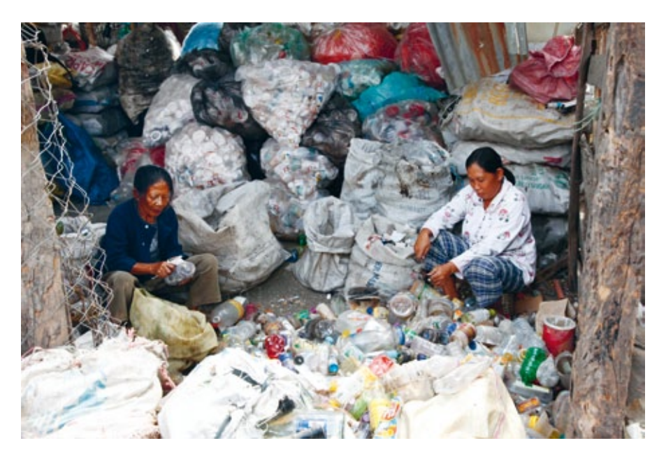
Photograph 6: Women sorting plastic materials, the Philippines

creases due to significant capital investments in diverting waste from dumpsites. In the case of informal sector integration, in all six cities the fraction of waste going to final disposal is less than – or in the case of Pune equal to – the fraction disposed in the current situation or in the subtraction scenario.