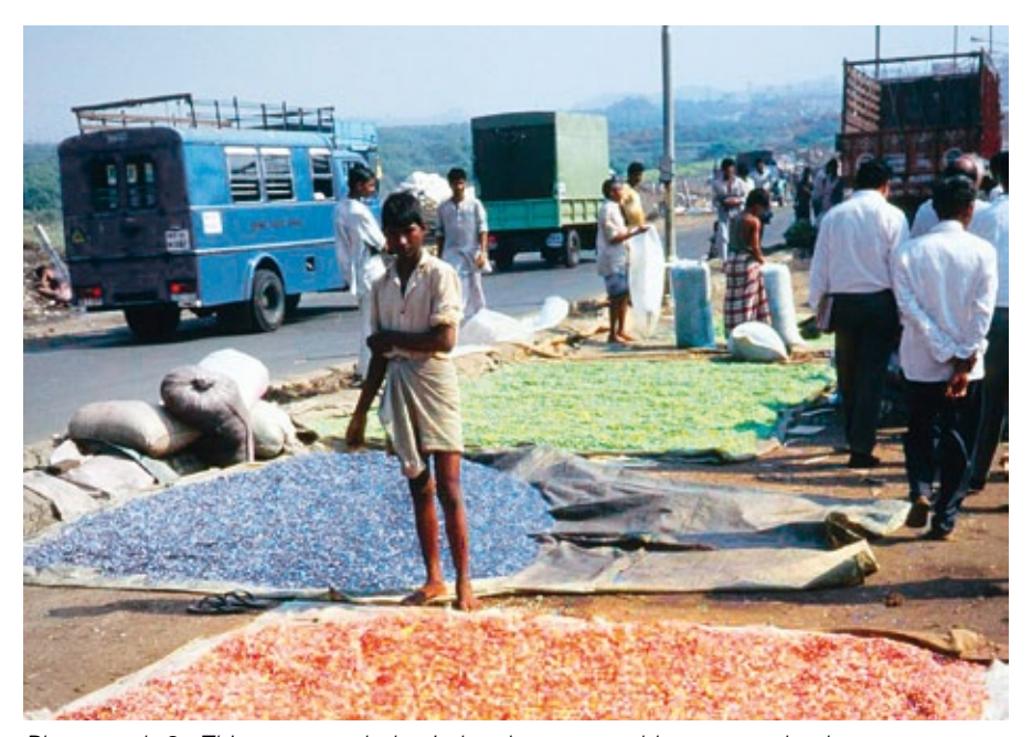
Photograph 3: This recovered plastic has been sorted by type and colour, cut into small pieces and washed, and it is now drying in the sun, in preparation for further processing