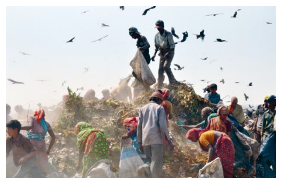
Photograph 2: Dump pickers looking for materials they can recycle