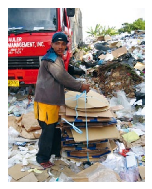
Photograph 4: Recovery and recycling of paper (here in the Philippines) and other materials contribute to reduce emissions

The viability of informal businesses depends on their ability to identify unoccupied niches in the waste and materials chain in the city. For example, informal service providers identify and identify opportunities for collection in areas which are not served. They find and extract materials from disposal facilities and waste generators that are not already part of a materials cycle, and complete that cycle.