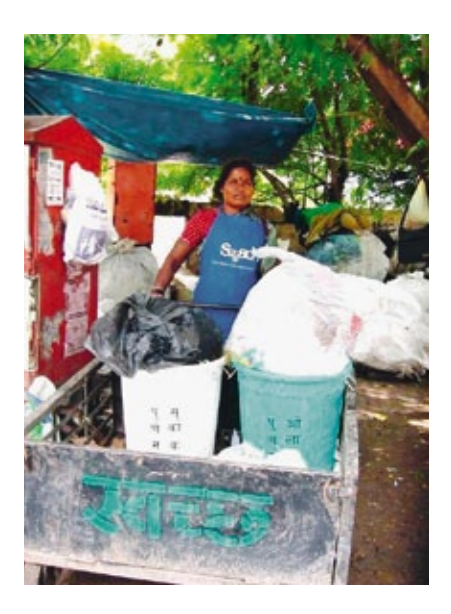
Photograph 5: A member of the Swach association in Pune

The role of informal recovery in family income and maintenance varies. Certain occupations are full-time family or individual enterprises; others are part-time, often seasonal alternatives to economic activities in agriculture or industry. On average, 71% of all informal sector households where someone works in the informal sector depend fully on the income of that person.