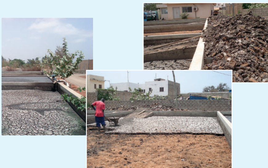
Figure 7.6 Unplanted drying beds, sludge removal and accumulation at Cambérène treatment plant, Dakar, Senegal.

As presented in Case Study 6.2, the Cambérène FSTP is a combination of settling/thickening tanks and unplanted drying beds. The drying beds were designed based on a 200 kg TS/m 2 /year loading and a 20 cm deep sludge layer. The operator considers the sludge sufficiently dried when it can be easily removed with a spade, i.e. when the sludge is not sticking to the sand layer anymore. In the climatic conditions of Dakar, this corresponds to 30-35 days drying, even during the rainy season. The dry matter content reaches about 50%, which is an average, with a drier layer on top and 20-30% dry matter in the deeper layer of the sludge. As the operator takes one week more for organising the dried sludge removal, each of the 10 beds of 130 m 2 takes 40 day cycles. This leads to an effective loading rate of 340 kg TS/m 2 .year. As a consequence, the operator usually uses only 6-7 beds instead of the 10 beds.