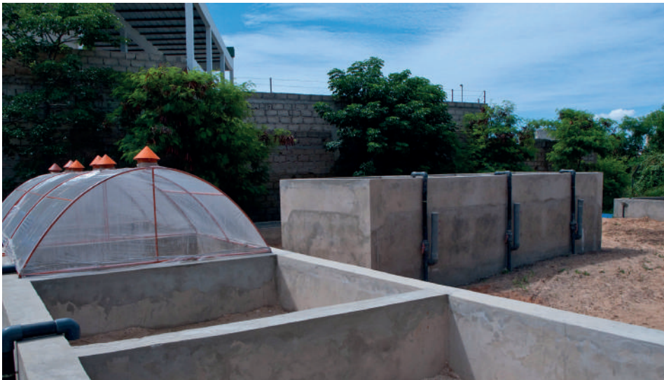
Figure 7.6 Pilot scale research facility at Cambérène treatment plant, Dakar, Senegal. Evaluating rates of dewatering with passive and active ventilation with greenhouses.

A further option is to use stainless steel wedge wire as a surface to enhance sludge drying and drainage, or to reduce the amount of sand that partitions with the sludge upon removal (Tchobanoglous et al. , 2002). Whilst this is effective for the drying of wastewater sludge its effectiveness for FS drying has not yet been reported.