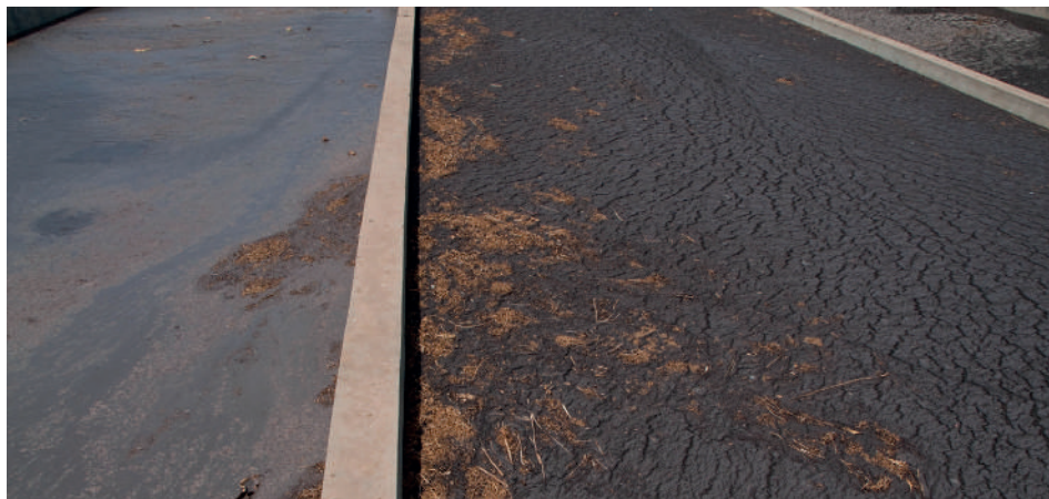
Figure 7.2 Freshly loaded and partially dewatered faecal sludge on unplanted drying beds at Niayes faecal sludge treatment plant, Dakar, Senegal.