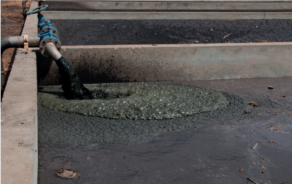
Figure 7.4 Loading of the beds at Niayes faecal sludge treatment plant, Dakar, Senegal.