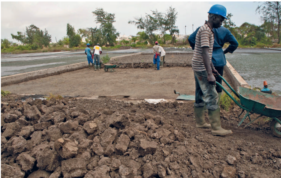
Figure 7.5 Removing sludge from unplanted drying beds at Cambérène treatment plant, Dakar, Senegal.

Rewetting of the sludge is considered problematic if rainfall occurs before the free water of the sludge is completely drained. In this case, the moisture content of the sludge increases again and the drying period is prolonged. When the sludge is already dry enough to expose the sand layer through the cracks in the sludge, rain water can pass straight through the sludge and drains through the drying bed.