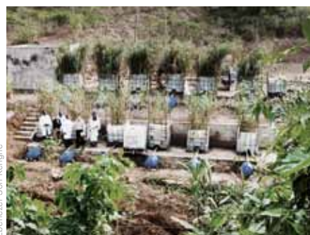
Photo 1: View of the experimental setup.

Planted drying beds in series appear to be a very promising technology for the solid-liquid separation of faecal sludge, and the subsequent treatment of leachate. This treatment scheme is low-cost, relatively easy to operate, and produces plants that can be sold as fodder. However, the receiving environment of the effluent needs to be carefully evaluated due to the nitrate and coliform concentrations. The next phase of this research will evaluate the use of stabilization ponds for the treatment of leachate from planted drying beds.