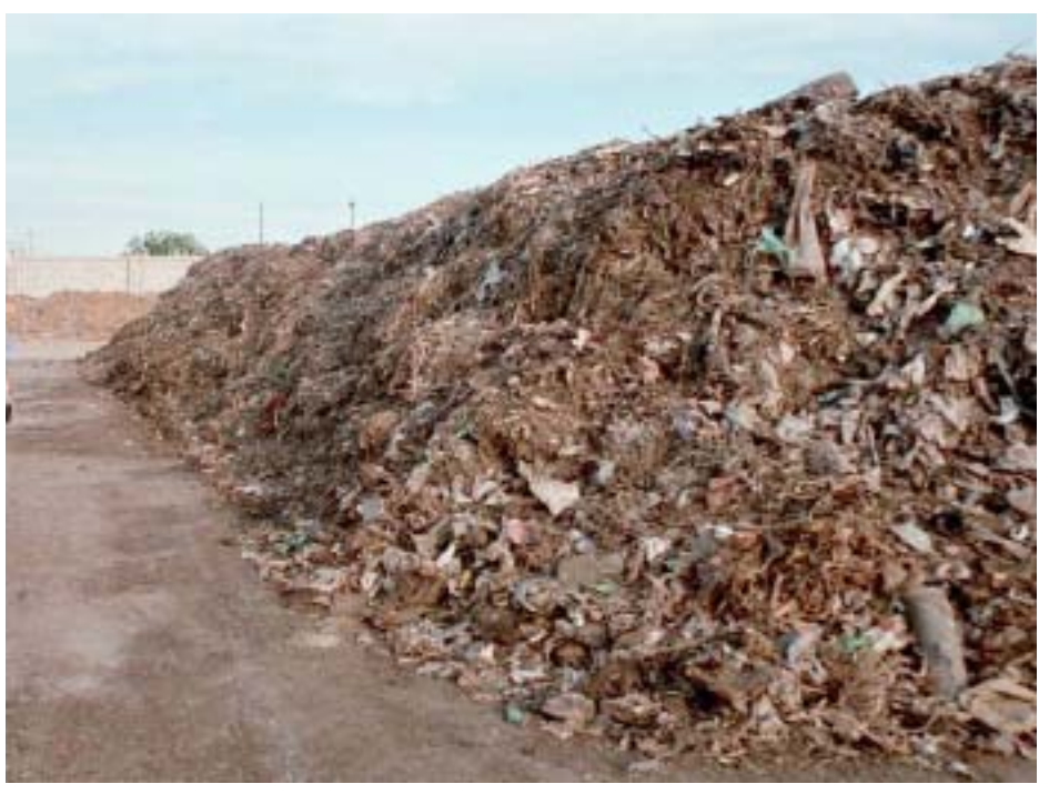
Figure 2: KCDC, elongated heaps (windrows) on sealed composting surface

In the 70ies, on 15 acres of land KCDC processed 50-60 tons of mixed waste per day. They have expanded to using 22 acres and processing 150 tons/day until last year, and currently process 250 tons/day of mixed waste plus 50 tons/day of market waste for which they won a tender to collect it in their own vehicles. KCDC hopes to increase waste intake to a total of 400 tons/day after commissioning the vermi-composting bins which are currently in construction on additional 7 acres.