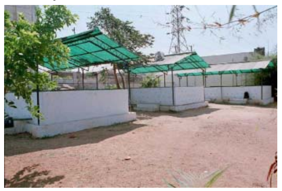
Figure 1: Composting bins of the main Kalyana Nagar composting site

In the solid waste management project component, focus was set on developing an approach of action and mobilisation among the community to initiate and implement a community operated solid waste management system. This also involved setting up a composting scheme for the biodegradable fraction.