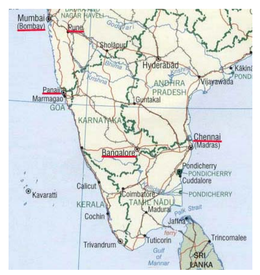
Figure 5: Map of visited locations