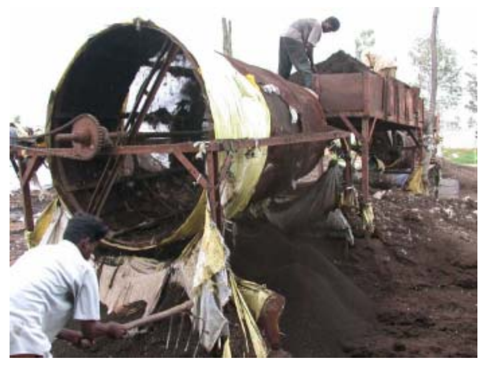
Figure 3: KCDC rotary screens

Two Bobcats are used for cleaning the site and feeding the rotary screens and spreading coarse compost for soaking up leachate from the heaps. Recently KCDC has also added a 50,000 litre leachate storage tank.