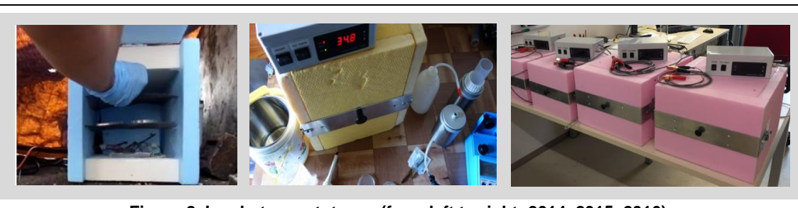
Figure 2. Incubator prototypes (from left to right: 2014, 2015, 2016)

The incubator setup is based on an insulated chamber with a thermostat regulating the inside air temperature via heating units and ventilation for uniform temperature distribution. The heating units were split into a permanent and an auxiliary heater, the latter being connected to a manual switch to allow laboratory staff intervention in case of very low ambient temperature conditions or rapidly dropping temperatures (Figure 3). The incubator was designed for an electrical power of 6-9 Watts as compared to 30 Watts for similar-sized commercial systems with less insulation. The basic setup is applicable for ambient air temperatures between 5° and 35° C. The setup can be modified for use in colder environments with additional insulation and heat plates, or for warmer environments with simple cooling elements such as a Peltier device or thermoelectric cooler. The material costs for the construction of the incubator unit are estimated at around 100 US-Dollars depending on supplier choice.