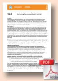
Document D2.2: Conducting Randomised Sample Surveys D2.2.pdf