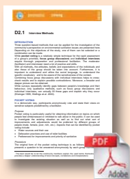
Document D2.1: Interview Methods D2.1.pdf