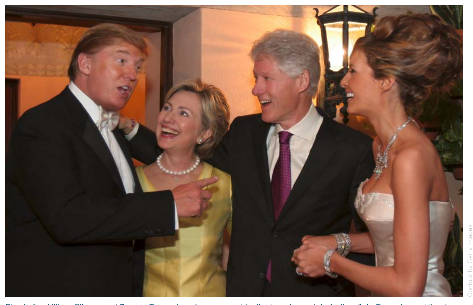
Fig. 1: Are Hillary Clinton and Donald Trump less far apart politically than they might believe? At Trump's wedding in 2005, at any rate, there was no sign of the bitter rivalry that now divides the two US presidential candidates.

Political actors tend to perceive their opponents as more influential than they really are, and to overestimate the differences between opposing groups. As a result, policy making and the search for feasible compromises become more difficult. This phenomenon, as Eawag political scientists have now shown, is apparent even in a consensus-based democracy like Switzerland. By Andres Jordi