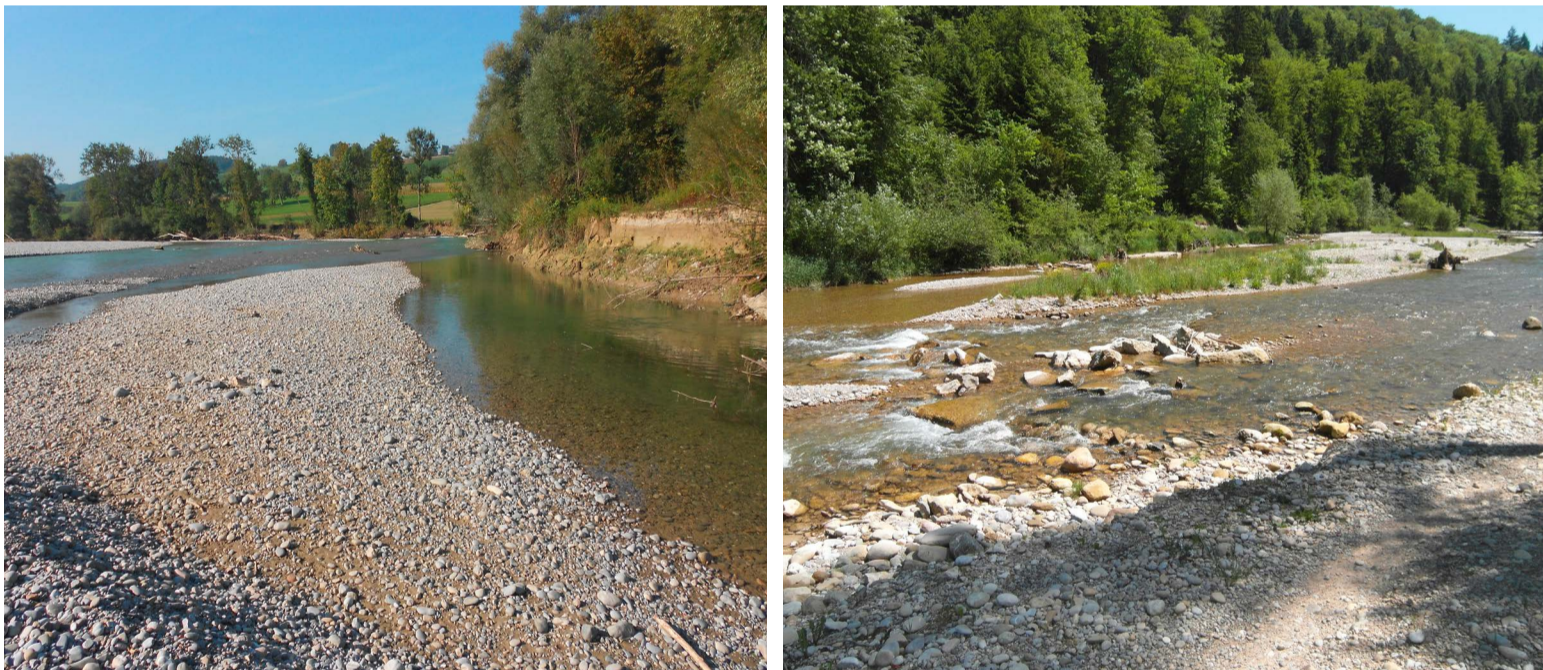
Fig. 2: Restored reaches of the Thur (left) and Töss (right).

Working with colleagues from the Department of Systems Analysis, Integrated Assessment and Modelling, and the University of Duisburg-Essen, Paillex therefore developed a method that allows the ecological effects of restoration measures to be assessed systematically. The method, which involves a mathematical approach used in decision analysis, is based on the modular stepwise procedure developed for the assessment of Swiss lakes and rivers. It addresses all the relevant states of a watercourse – physical (morphology and hydrology), chemical (water quality) and biological (animals and plants). Existing assessment methods for fish and macroinvertebrates were combined with new methods for the evaluation of ground beetles, riparian vegetation and aquatic plants.