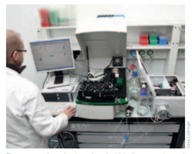
Flow cytometry is used to determine microbial cell concentrations and community composition in water supplies.

In order to assess the suitability of plastic materials for water contact applications, Koetzsch and his colleagues have developed a combination of methods known as "BioMig". Various tests are used to determine the amount of organic carbon leaching into water from plastic samples, and to what extent these compounds support the growth of microorganisms. Koetzsch explains: "With BioMig, we can estimate the influ-