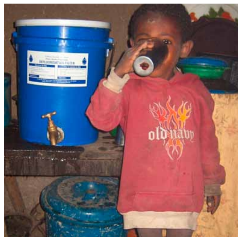
Fig. 5: A community arsenic removal filter installed in Bangladesh and a household bone char filter used to remove excess fluoride in Ethiopia.