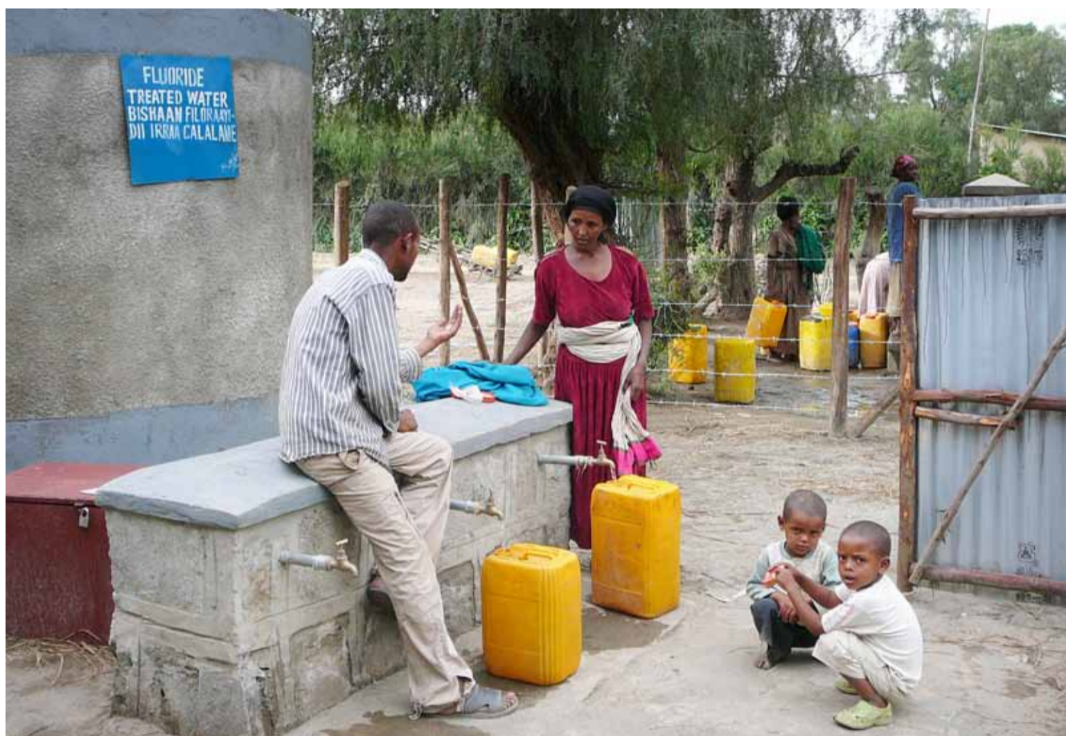
Fig. 1: Safe drinking water: fluoride is removed by a community filter installed in the Ethiopian village of Wayo Gabriel.

In many regions of Asia, Africa and South America, consumption of groundwater contaminated with arsenic or fluoride causes severe health problems. A new handbook offers authorities and planners practical guidance on addressing geogenic contamination. By Andres Jordi