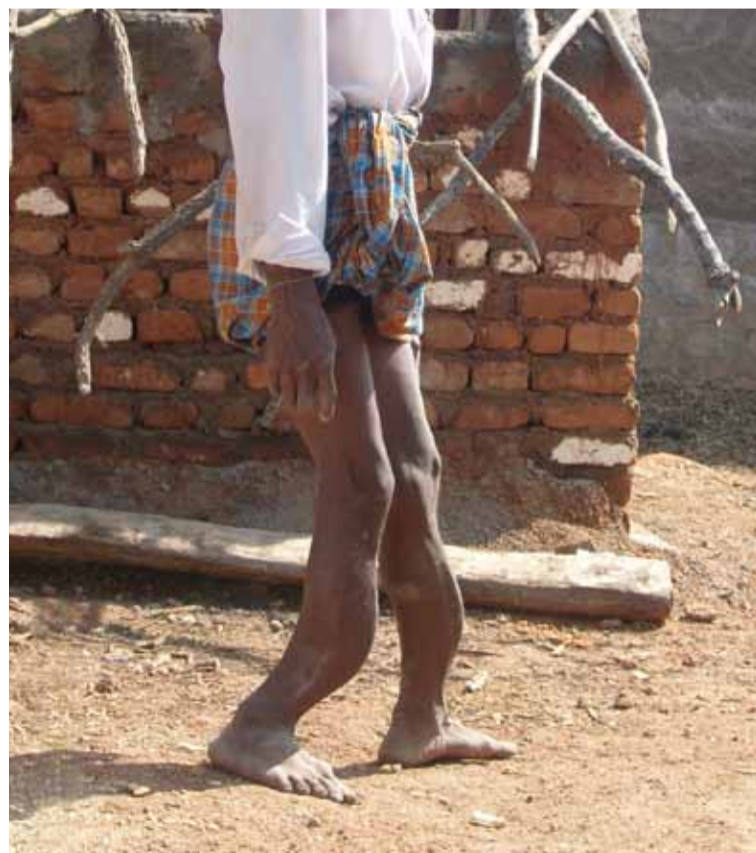
Fig. 3: Arsenic poisoning can cause hyperkeratosis (skin thickening) or even cancer. Chronic exposure to fluoride is associated with bone and joint deformities.