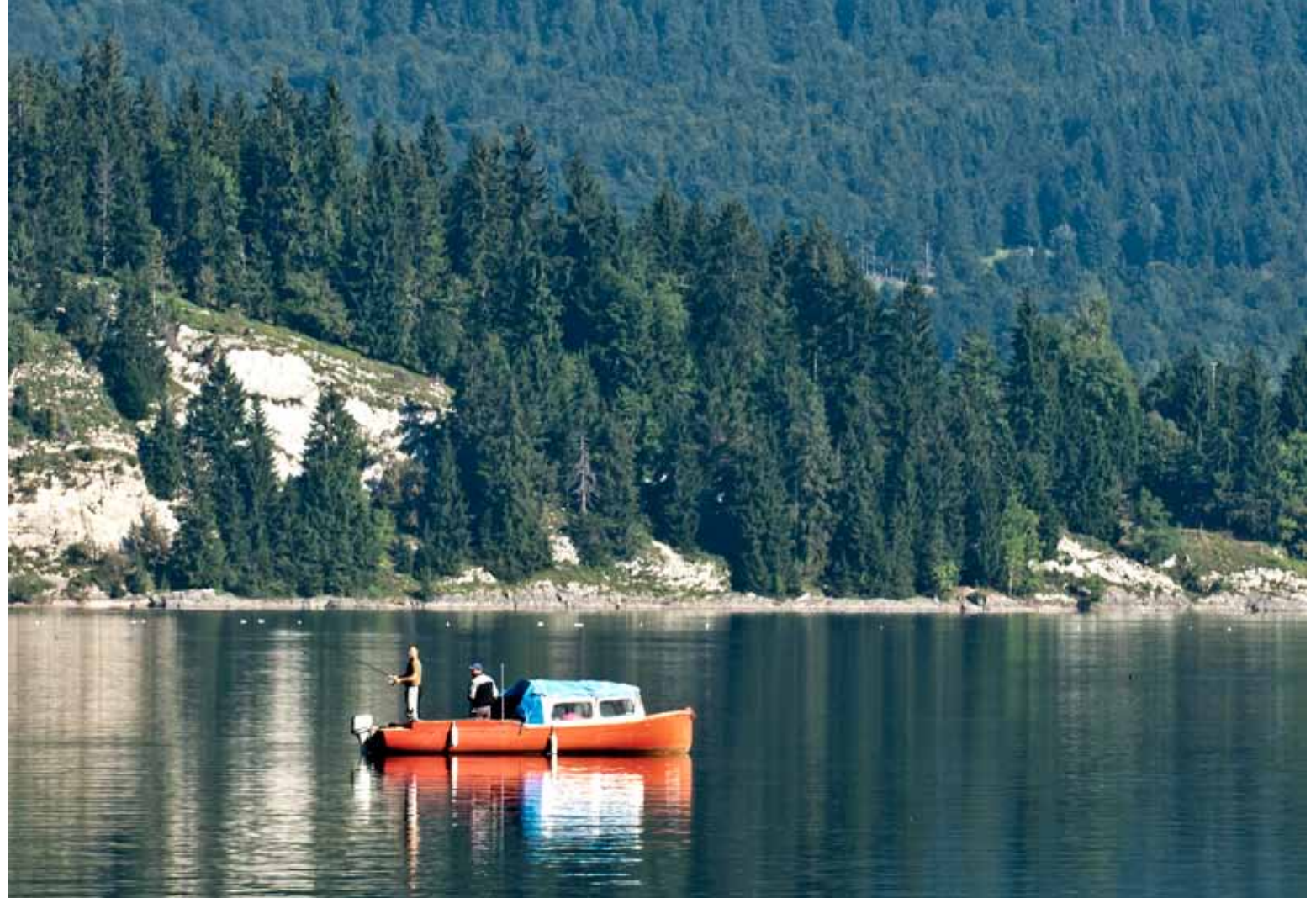
Fig. 1: The landscape of the Joux Valley (Canton Vaud) is today dominated by the lake and extensive woodlands.

A lake's sediments are a window onto the past – the various layers deposited over time can provide valuable information on changes in local environmental conditions. Eawag researchers have studied how the settlement and economic development of the Joux Valley in Canton Vaud is reflected in the sediments of Lake Joux. By Andres Jordi