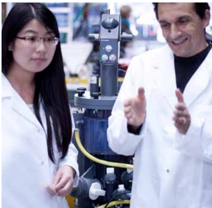
Our staff includes people from over 35 different countries.

The tenure evaluation period at Eawag is five years. The initial contract is for two years with a three-month probation period. After the probation period, each tenure-track researcher meets with the Director for an informal "0th" career discussion. This is an opportunity to clarify the tenure process and expectations and to answer questions. Annually, the tenure-track researcher has a personnel discussion to review his or her progress and set goals for the coming year with his or her Department Head and one member of the Directorate, who attends in the capacity of coach for the Department. After 1.5 years, the tenure-track researcher has a formal first career discussion with the Director to provide input for the Directorate's discussion on the re-appointment. If the re-appointment is approved, the tenure-track researcher's contract is extended for an additional three years. The candidate must submit his or her tenure package approximately five months before the end of the contract.