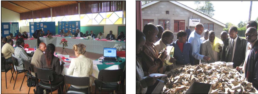
Figure 1-3: On the left, presentations at a regional workshop in November 2006. On the right, demonstration of the crushing process as part of a local workshop in September 2006.