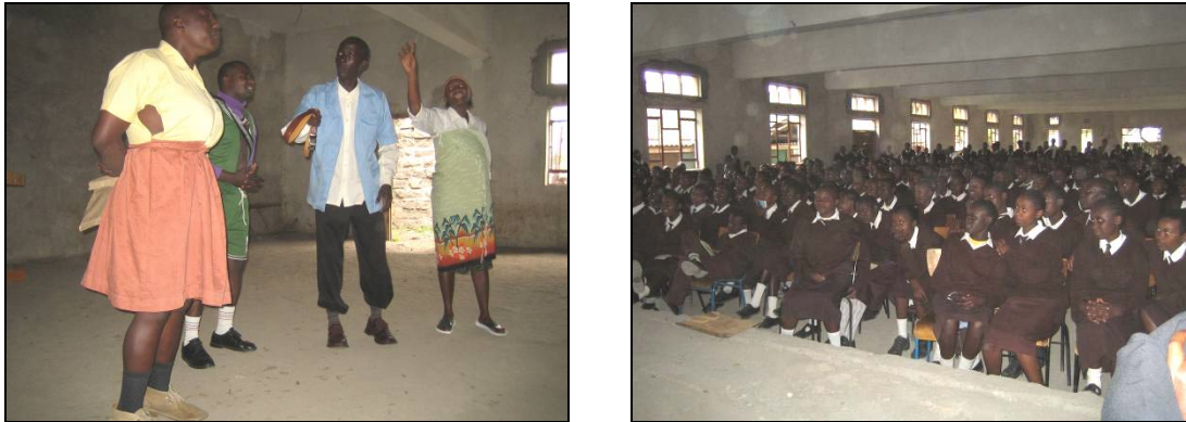
Figure 1-2: CDN's theatre group performing on fluoride related health issues in a primary school in Nakuru (2005)