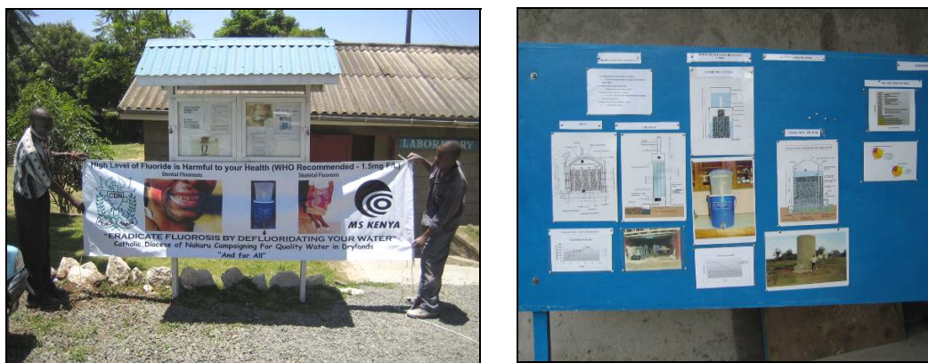
Figure 1-4: On the left; information stand and a banner on fluorosis and defluoridation. On the right; mobile information stands displayed at the show ground of the Agricultural Society of Kenya.

plants to inform the visitors on fluoride related issues. Mobile information stands are displayed at exhibitions and workshops.