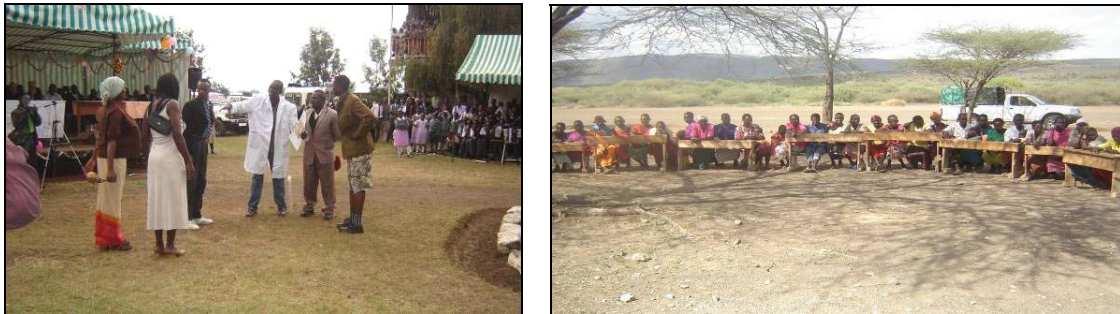
Figure 1-1: On the left, community meeting in Nakuru (2006). On the right, a planning meeting at Baringo district (2006).

performs plays describing the health effects of excess fluoride and defluoridation treatment to various target groups.