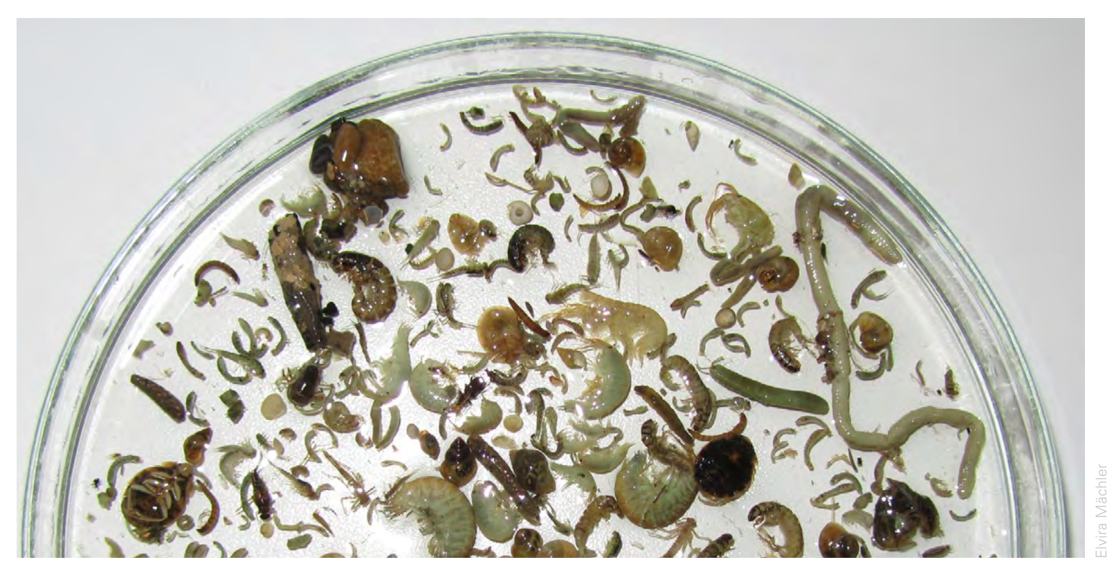
Fig. 1: Conventional methods used to inventory macroinvertebrates are time-consuming and lethal.

Effective environmental management depends on a detailed knowledge of the distribution of species. But taxonomists are in short supply, and some species can be difficult to identify, even for experts. Analysis of environmental DNA offers a promising new approach for biomonitoring. By Andres Jordi