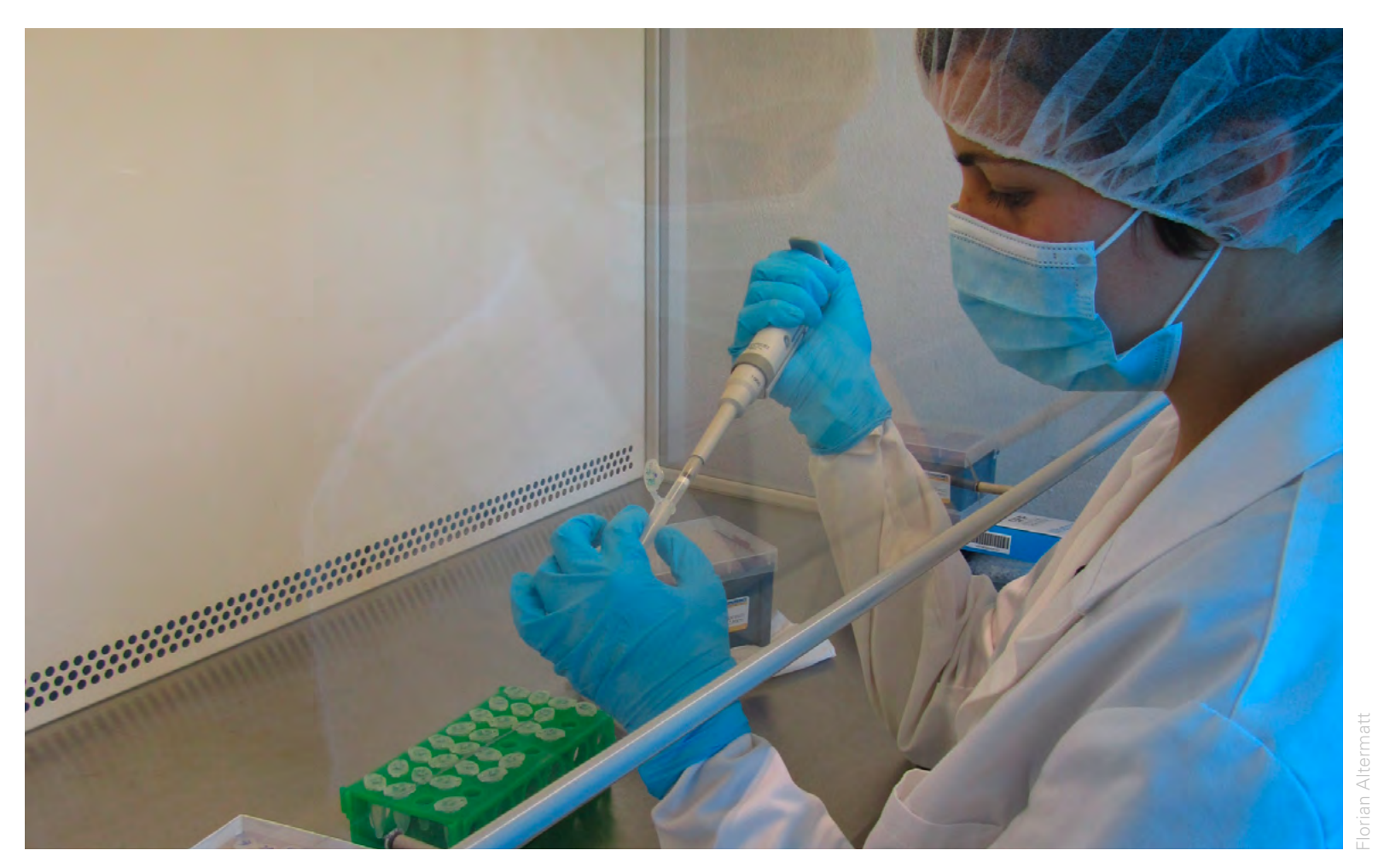
Fig. 3: Special precautions are taken to avoid contamination of samples with extraneous DNA.

In the case of organisms occurring in small populations, however, the eDNA method appears to be more sensitive. Using this approach, the biologists detected the rare mayfly Baetis buceratus not only at all the sites where it was found with the conventional method, but also at two sites where no Baetis specimens where detected by kicknet sampling. Accordingly, the researchers believe that the new method may also be suitable for the detection of invasive species at an early stage of colonization. In fact it is already incorporated by governments for monitoring invasive carp species (US) and the highly endangered Great Crested Newt (UK).