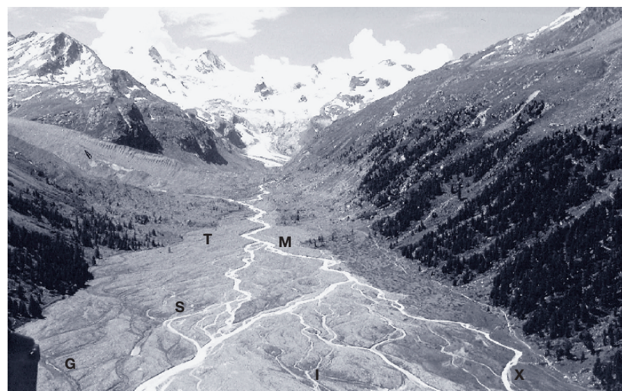
R. Zeh, EAWAG

The Val Roseg flood plain is characterized by distinct expansion and contraction periods that are associated with major changes in channel network length; a common phenomenon in lotic systems that has been given only scant attention by river ecologists. In the Val Roseg flood plain, channel network length increases from about 5 km in winter to more than 20 km in summer. Hydrochemical indicators were employed to link the expansion/contraction cycle with shifts in dominant hydrological processes. Indicators include sodium (groundwater contribution), nitrate (snowmelt water) and particulate phosphorus (glacial meltwater). The relative proportion of the major water sources to total floodplain discharge changes during the annual cycle [4], with subglacial and hillslope ground water dominating in winter, snow-melt water in spring and glacial meltwater in summer (Fig. 2). Based on a mixing model [5], the relative contribution of hillslope ground water to total floodplain discharge ranges from <10% in summer to >70% in winter. Therefore, the entire flood plain shifts from a uniform groundwater-dominated system in winter to a heterogeneous glacial-meltwater dominated system in summer. The seasonal shift in the relative proportion of water sources control the availability of key ecological resources such as nutrients, organic matter and temperature (see article p. 18).