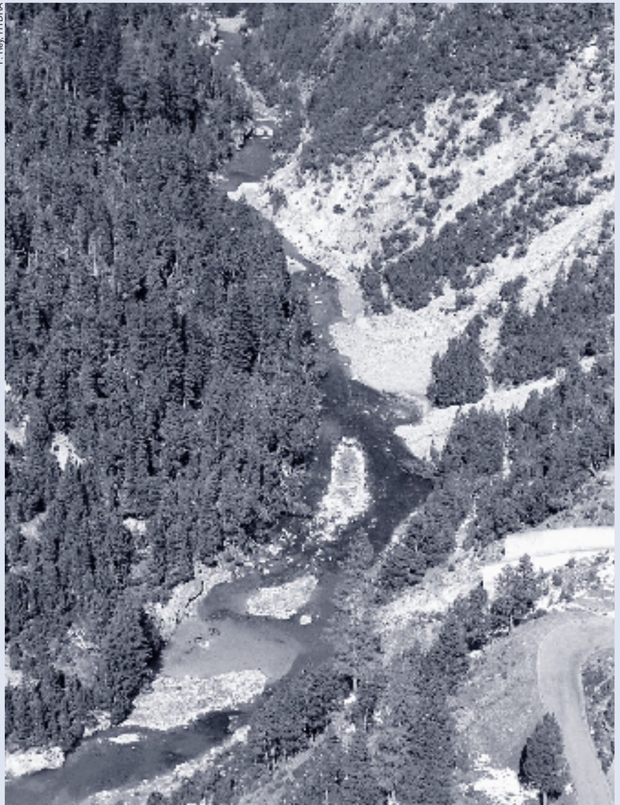
The heavily impacted Spöl under residual flow conditions.

In 1990, the Engadin Power Plants released deep water from the Livigno reservoir, which provided an opportunity for scientific studies covering a wide range of disciplines. These studies revealed that the section of the Spöl within the National Park below the dam had gradually turned into a series of pools with fairly stagnant water. This development did not appear to be prevented even by occasional flushing events and draining of the reservoir. In addition, it was discovered that the smaller retaining reservoirs within the National Park functionally turned into additional wastewater treatment basins for the Upper Engadin since they received water from the Inn. After extensive discussions, the Science Commission for the National Park decided to revert this stream system, which is significantly impacted by sediment transport and deposition, back to its original condition as far as this is possible under the current conditions. The primary tool available for achieving this are artificial flood events. Due to good relationships between the board of directors for the EKW and the administration of the Canton Grisons, the first flooding experiments were conducted in 2000. Until 2002, three annual high water events are planned for the period between June and August. These experimental floods are accompanied by interdisciplinary research, with intensive collaboration by the Limnology Department of EAWAG (see also article