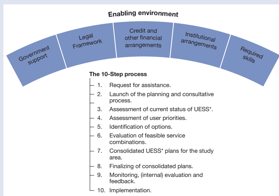
Fig. 3: The two main components of the provisional guideline for the implementation of the HCES approach: the enabling environment and the 10-step process. *UESS = Urban environmental sanitation services.

Further Informationen: www.sandec.eawag.ch , www.wsscc.org