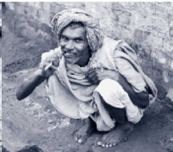
About 40% of the world population do not have access to proper sanitation.

and implement environmental sanitation infrastructure and service delivery in a sustainable way. The approaches that should guide them in arriving at such sustainable solutions within each zone include some or all of the following [2]: