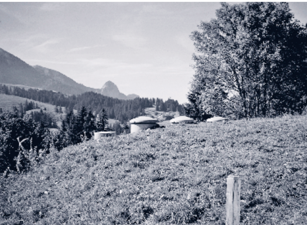
... pasture grazing can lead to animal faecal contamination of drinking water catchments.

the value rises for AIDS patients to 11.8%. It is calculated that in Switzerland annually there are 340 cryptosporidiosis cases [8]. In reality, only a few are clinically identified. This could be due to the following reasons: