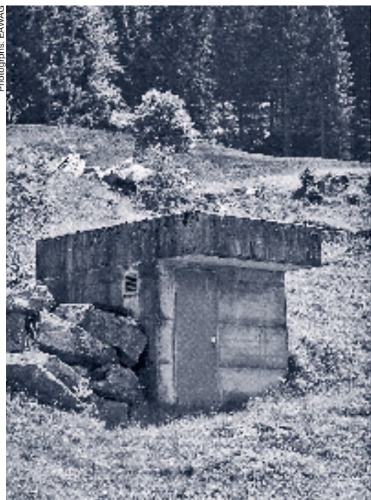
Fig 3: Manure spreading and ...

Switzerland has so far been spared an epidemic. The prevalence of diarrhea cases – i.e. the percentage of the Cryptosporidium contaminated diarrhea patients at a given time – is in Germany and Switzerland for the general population at 0.4–1.9%. Children are harder hit, at a rate of 1.1–4.8%, while