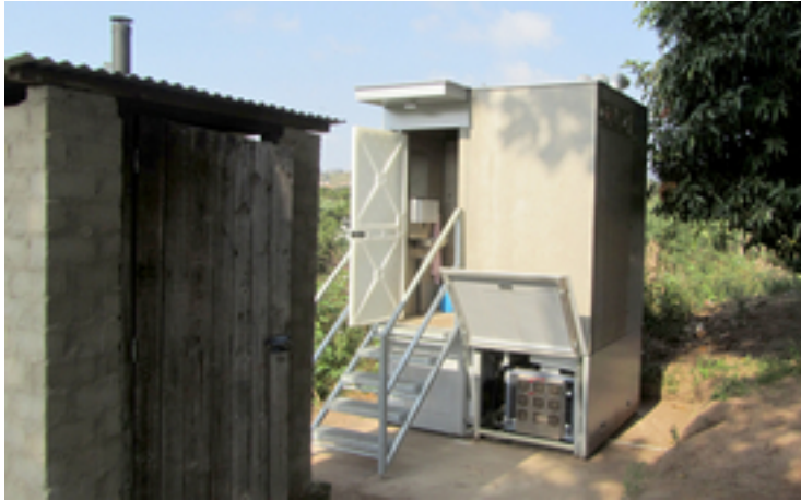
The Blue Diversion Autarky toilet in test on the outskirts of Durban, South Africa. The evaporation module is visible in the front right.