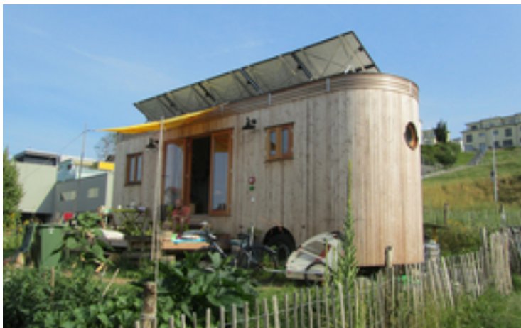
Autonomous urine treatment with nutrient recovery is also being tested in the innovative Tinyhome "Tilla". The evaporation module can be seen small on the back right.

Nutrients can be removed from wastewater in conventional wastewater treatment plants, processed and returned to regional material cycles. But end-of-pipe processes require space, technical effort, energy and chemicals. It is not the case that all this is omitted with decentralised or semi-centralised treatment of wastewater. But an early separation of the different material flows enables more flexible solutions, especially in terms of process technology. One example of this is the Blue Diversion Autarky Toilet developed at Eawag. It relies on on-site measures and technology that turns wastewater into useful products. At the same time, with Autarky, Eawag staff are researching and developing a platform that will gradually bring modern on-site technology to bathroom scale: What was still the vision of a few pioneers 20 years ago is now an interesting innovation in which more and more process engineers and companies are collaborating.