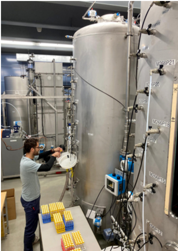
Filtration column at the Eawag laboratory (left) and on the pilot scale at the lake water facility of the Zurich Water Works (WVZ) (right).