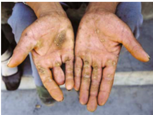
Hyperkeratosis on the palms and fingers and spreading towards the wrist; hyperkeratosis