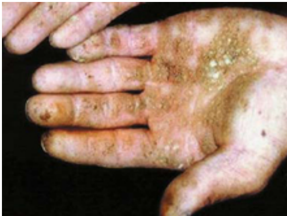
Arsenicosis at hand; coalescing plaques on the palm, especially on the thenar; fingers are seriously affected