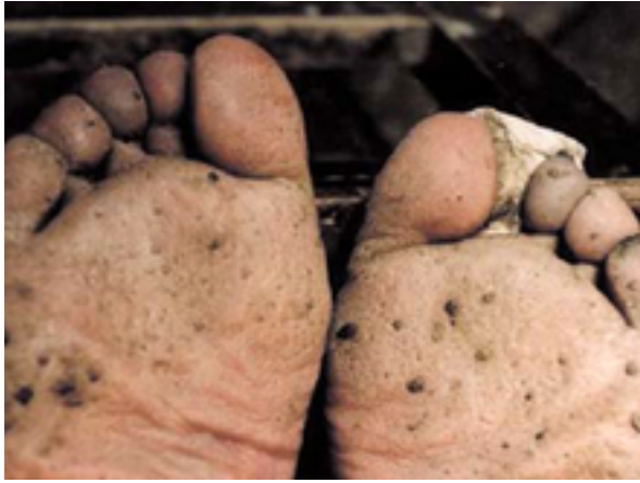
Arsenicosis at feet; Advanced case of hyperkeratosis on the sole and toes resembles fish scales