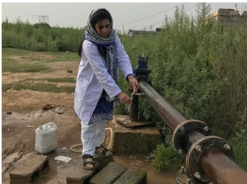
Collection of samples from a groundwater pump and a dug well in the Gujrat district of Punjab province