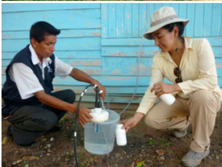
A typical groundwater well and scientists measuring geochemical parameters in Peru.