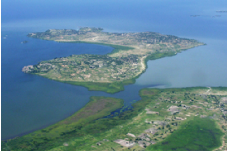
Water turbidity around Zinza Island: The increasing turbidity caused by erosion and eutrophication poses one of the greatest threats to biodiversity in Lake Victoria.