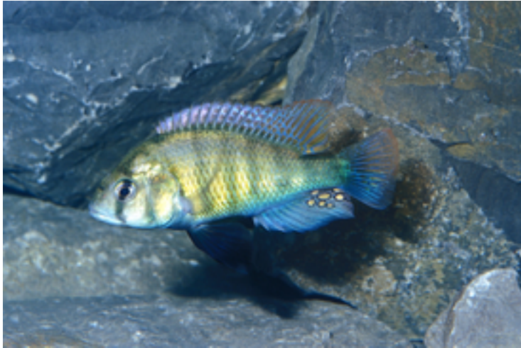
Haplochromis ishmaeli