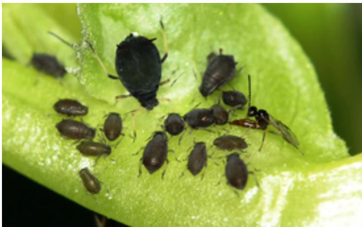
An adult female black bean aphid (Aphis fabae) and several of her clonal offspring under attack a by an ovipositing female of the aphid parasitoid Lysiphlebus fabarum.