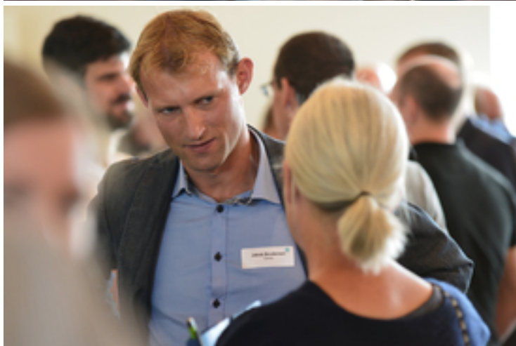
Fig. 5: One of the main aims of Eawag's annual Info Day event is to promote exchanges between researchers and practitioners.