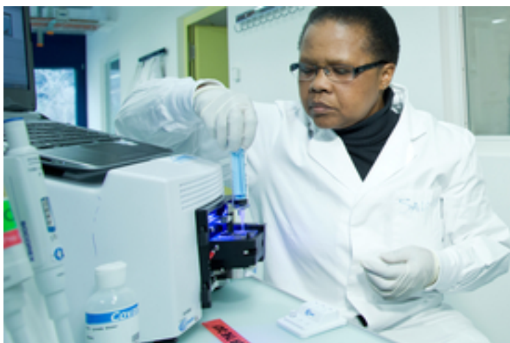
Fig. 4: In the Molecular Genetics Laboratory at Eawag's Kastanienbaum site, a technician carries out genome sequencing on fish samples. Modern analytical methods facilitate the study of biodiversity in lakes.

To investigate the migration of fish between Lake Lucerne and its tributaries, a research team led by fish biologist Jakob Brodersen implanted microchips in more than 5000 brown trout. The signals received from these so-called PIT tags indicate when the young fish migrate from the streams into the lake, and when the adults return to the spawning grounds. The initial results show that the proportion of migratory individuals in the various populations ranges from 5 to over 50 per cent. The timing of migration can also vary by more than two months. “This differs from one canton to another,” Brodersen quipped. “For example, denizens of canton Uri are tardier than in Canton Nidwalden.” The returning fish also differ markedly in size, measuring between 25 and 70 centimetres in length. According to Brodersen, measures to conserve and sustainably manage this species – which is endangered in Switzerland – would need to take these differences into account, e.g. when minimum catch sizes are specified for fisheries.