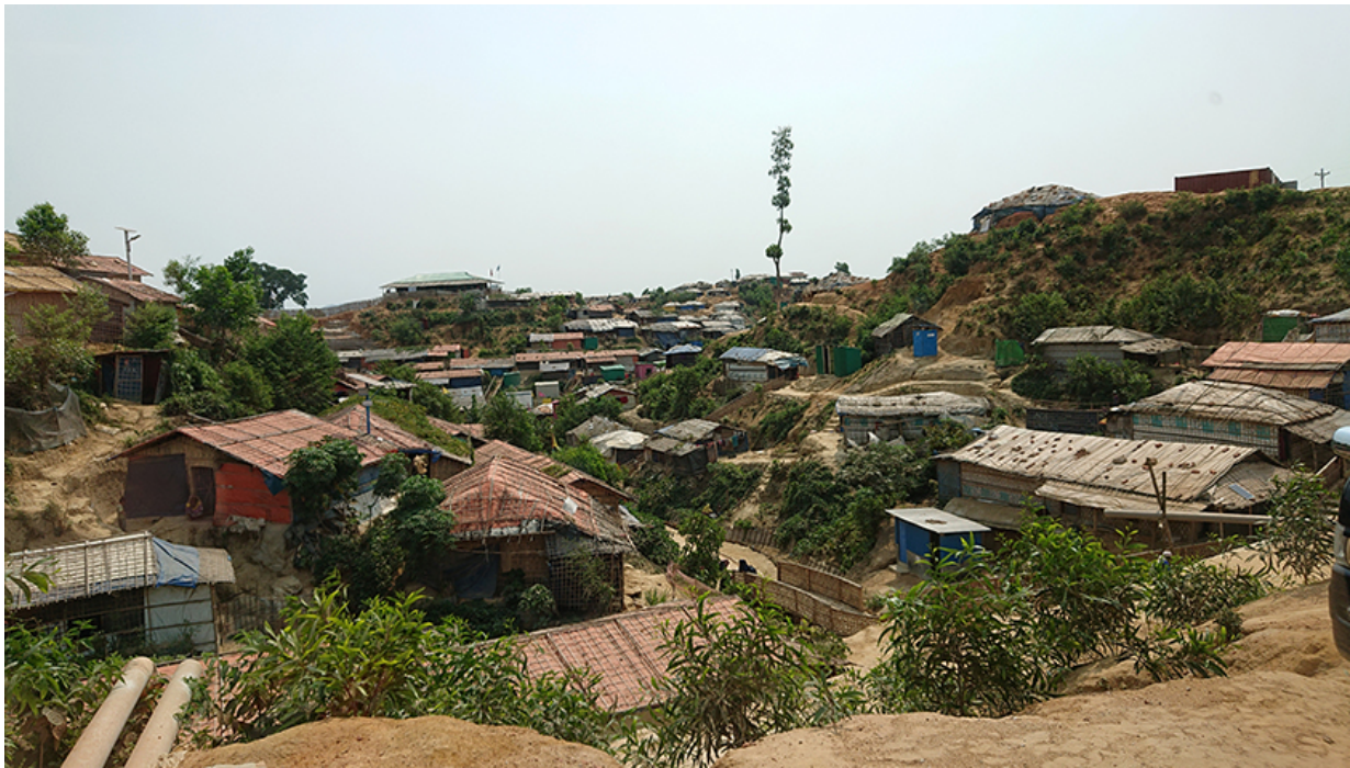
Rohingya camp, Cox's Bazar, Bangladesh.