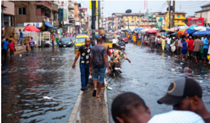
Flooding in Lagos, Nigeria: floods are becoming an increasingly serious problem in West Africa, which is likely to worsen with climate change.

We are also deploying the MCDA method in West Africa in a Horizon 2020 project funded by the EU, called FANFAR . The aim is to develop a reliable forecasting system for flooding events together with local stakeholders and experts from throughout West Africa.