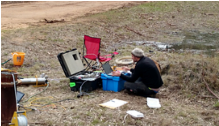
The Mini-Ruedi deployed in the

The principle of gas sampling via a membrane inlet.