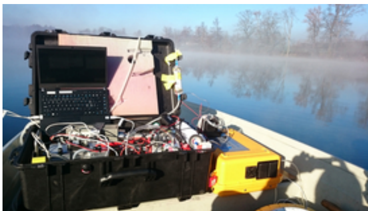
field - in Australia, Oman and on