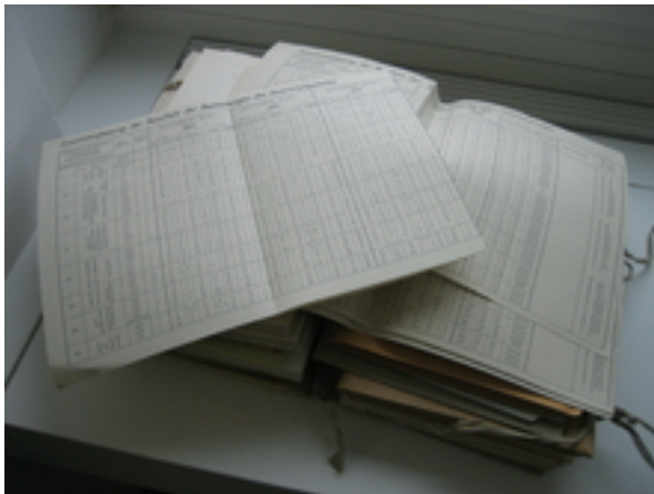
Oxygen concentration data as measured in a groundwater pumping well.