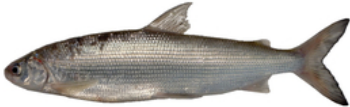
The newly described Lake Thun whitefish species, provisionally named "Balchen2"