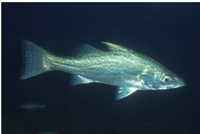
The Nile perch was introduced to Lake Victoria in the 1950s, leading to the extinction of numerous cichlid species.