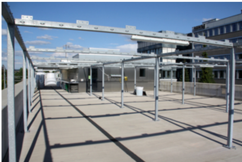
Accessible roof for open-air experiments, with construction to shade the equipment.