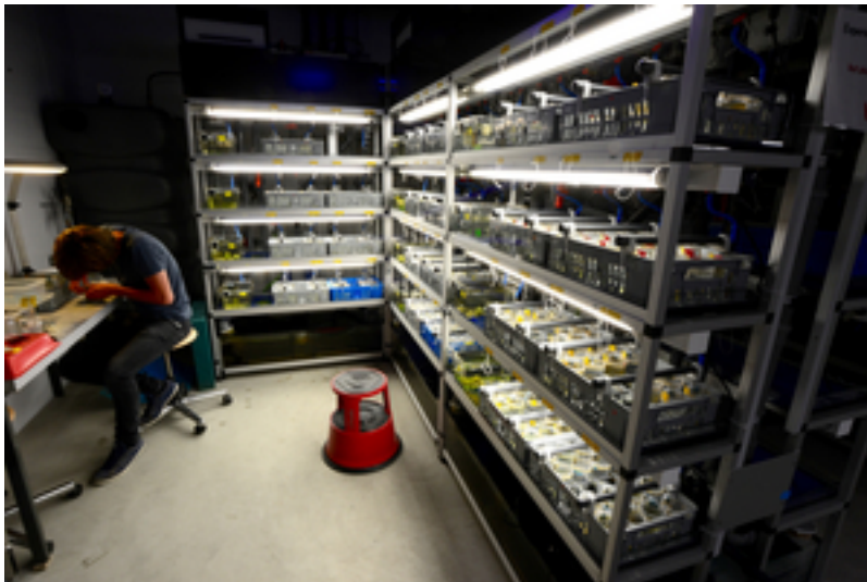
Air-conditioned rooms on the lower level for experiments with aquatic organisms.