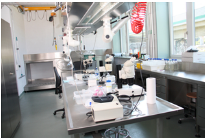
Laboratory on the ground floor.