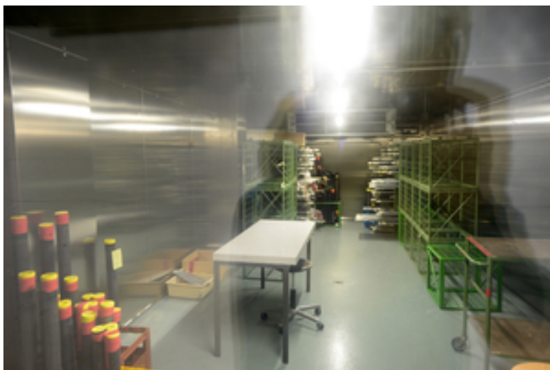
Room for storage and processing of sediment cores.