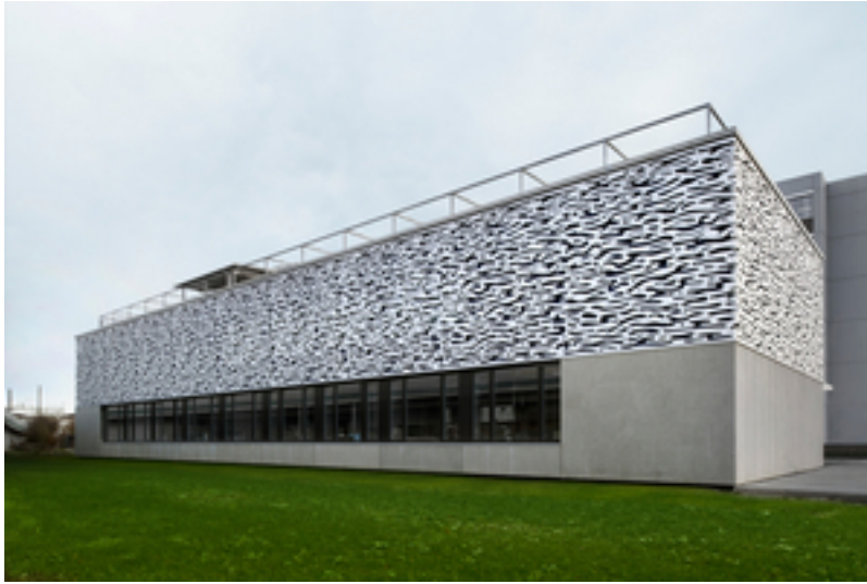
The new research building “Aquatikum” from the suburban-railway side (north).