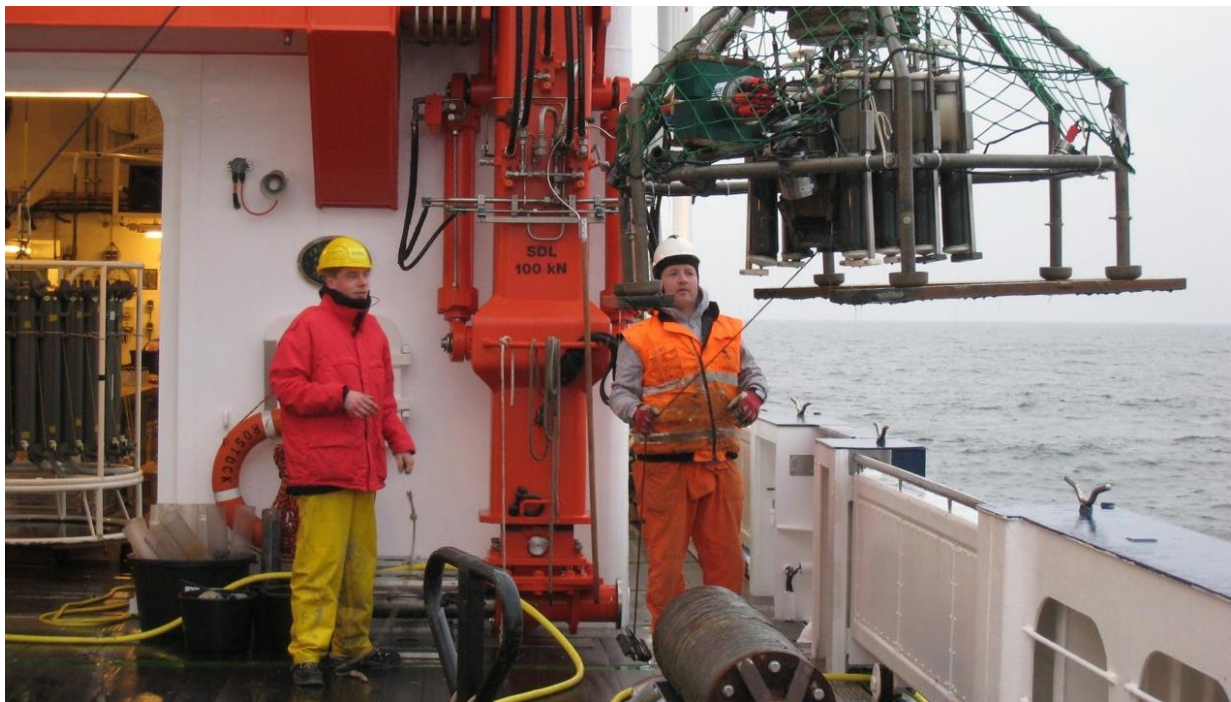
Sediment was retrieved with a Multicorer to allow for a detailed analysis of sediment biogeochemistry and its inhabitants along a transect of oxygen concentrations.