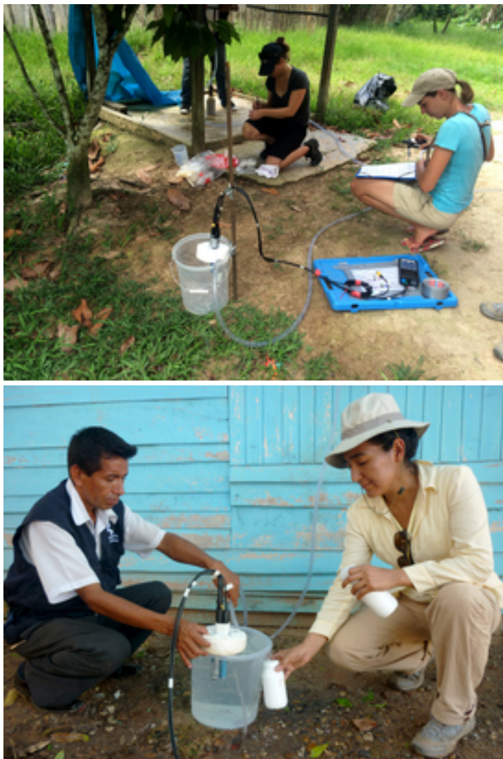
A typical groundwater well and scientists measuring geochemical parameters in Peru.