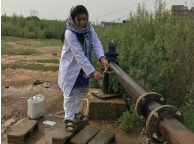
Collection of samples from a groundwater pump and a dug well in the Gujrat district of Punjab province