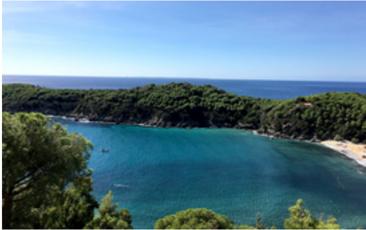
A part of Fetovaia Bay, in which most samples of this study were retrieved.