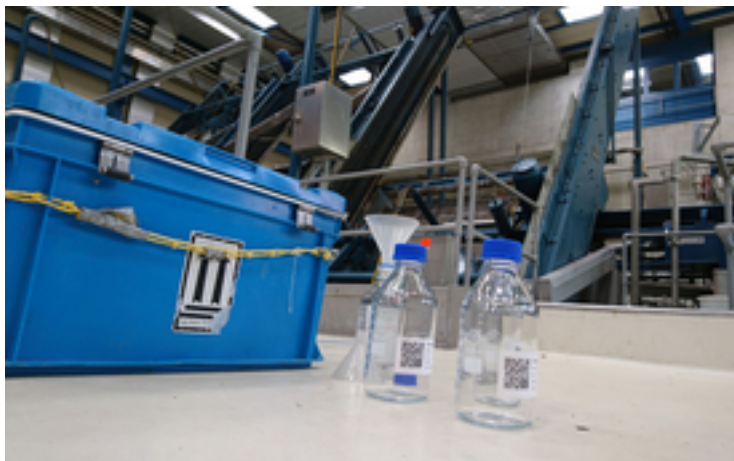
Sampling on the wastewater treatment plant Werdhölzli in Zurich.