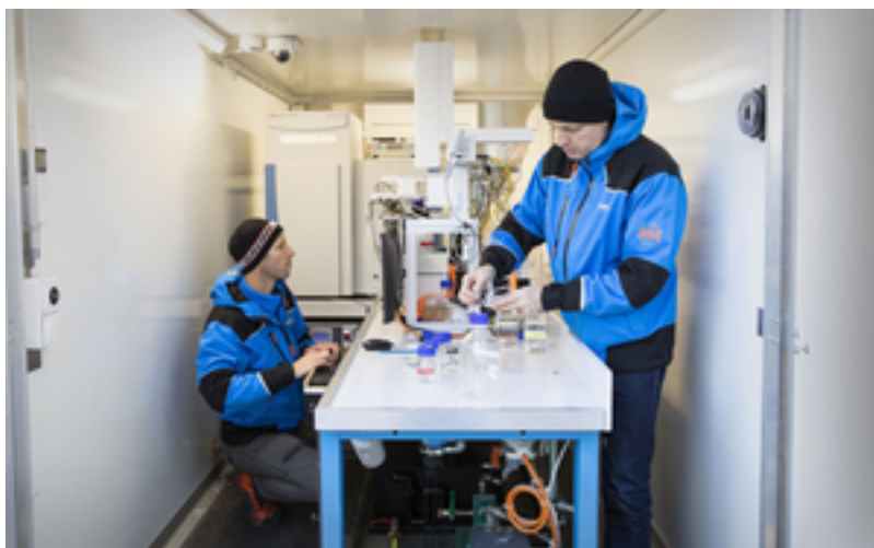
A view of the measurement trailer's interior.