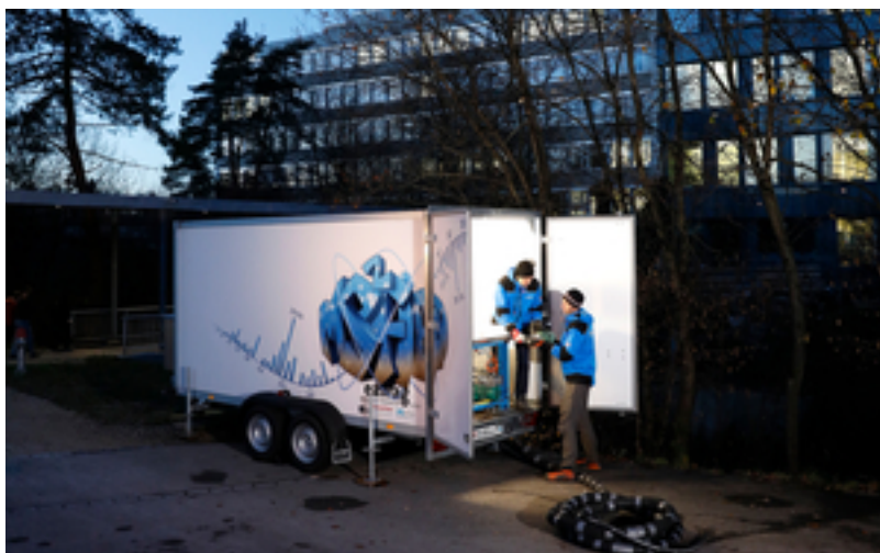
The mobile water laboratory during testing at the Chriesbach stream outside Eawag in Dübendorf.

as an example, the work has also revealed the importance of short-term peak concentrations from an ecotoxicological perspective. Indeed, the quality criterion enshrined in the Water Protection Ordinance with a view to preventing acute damage to aquatic organisms was exceeded on several occasions and many times over (by a factor of up to 30). For many pesticides, the peak concentrations recorded in the 20-minutely MS2field measurements exceeded the average concentrations recorded in the 3.5-day composite samples by a factor of up to 170.