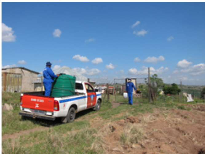
Fig. 4: Members of Durban's water

service staff on a urine collection round.