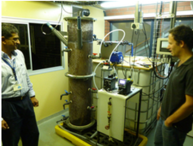
Fig. 6: Pilot plant at the Durban water