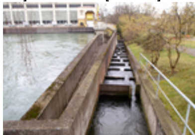
Fish ladders reduce the effects of barriers, but however not completely – here at hydropower station IBA Aarau