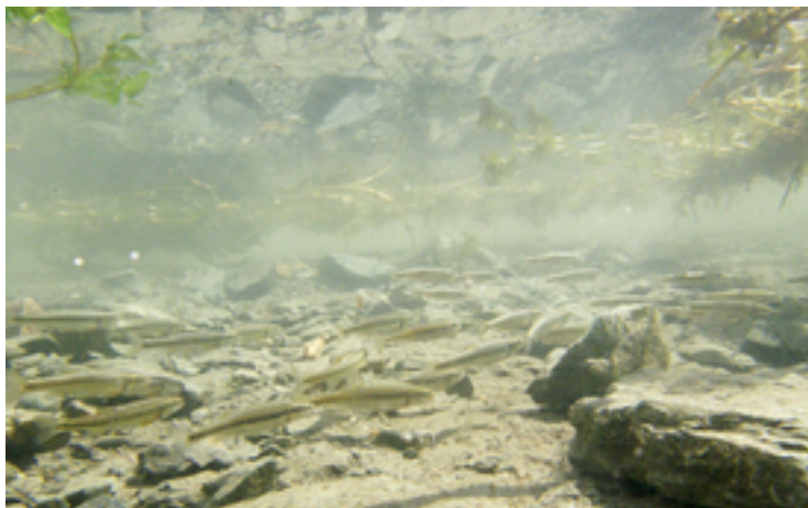
A shoal of minnows ( Phoxinus septimaniae ) in Lake Poschiavo.

Of a total of about 550 fish species now known in Europe, 106 were identified in the "Projet Lac". Although Switzerland accounts for only 0.4% of Europe's land area, it is home to almost 20% of the species. This makes it one of the regions in Europe with the highest diversity of fish species in freshwater. 15 (endemic) fish species, most of which are found only here, were identified and documented for the first time. In addition, five species were caught whose occurrence in Switzerland was previously unknown. Two species were found north of the Alps that were previously thought to occur only south of the Alps. And four fish species were rediscovered that were thought to be extinct, for example a char that lives at great depths in Lake Uri.