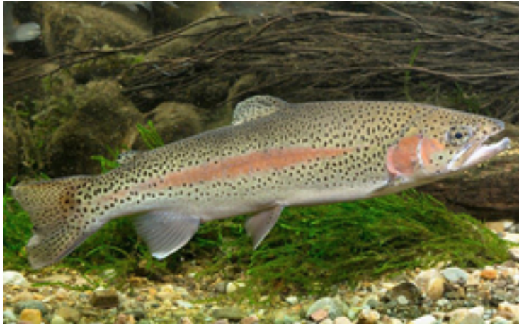
The cells were taken from the rainbow trout.