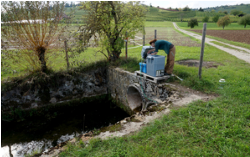
Collection of samples on the Hoobach (Schaffhausen)