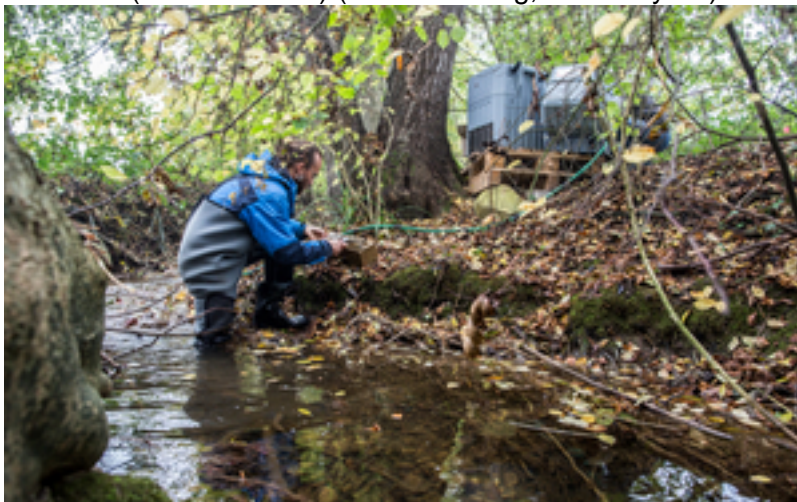
Collection of samples on the Eschelisbach (Thurgau)