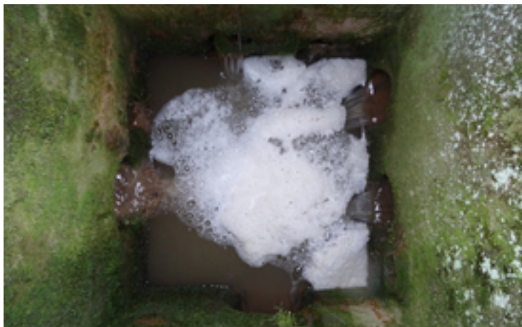
Here, water from several inlet shafts converges before flowing directly into the nearby stream.