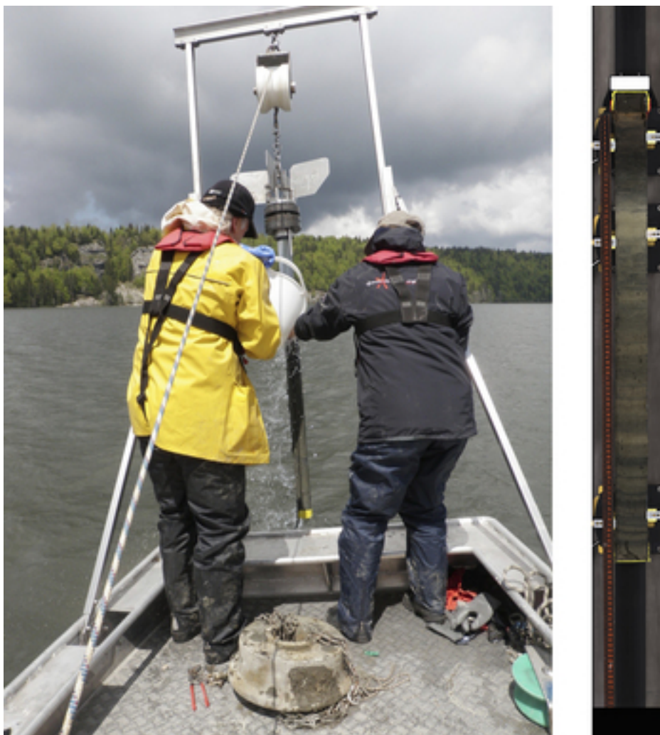
Fig. 2: A sediment core is retrieved from Lake Joux. The different layers are clearly visible in the JOU14-01 core cross section on the right.

These inputs peaked around 1500. Nutrients entering the lake with the soil promoted algal growth, as indicated by algal debris in the sediments. As economic development progressed and farmland was abandoned, erosion started to decline from around 1600. The composition of the sediment changed. Iron mining, which flourished at this time, left few traces. However, the bursting of a dike shortly after its construction in 1777 did have a visible impact: large quantities of sediments were disturbed or swept away. In addition, there was a drop in the lake water level. This, combined with growing evaporation due to warmer climatic conditions, led in the 19th century to increased precipitation of calcium carbonate. “So the sediments from this period are marked by lighter carbonate layers,” says Dubois.