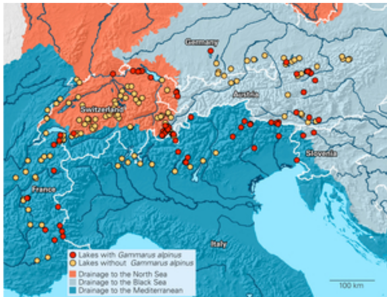
Fig. 4: The lakes where Gammarus alpinus occurs lie almost exclusively in areas draining into the Mediterranean or the Black Sea. Over 450,000 years ago, Lake Constance and the predecessor of the alpine Rhine – now part of the North Sea catchment – still drained into the Danube and thence to the Black Sea.