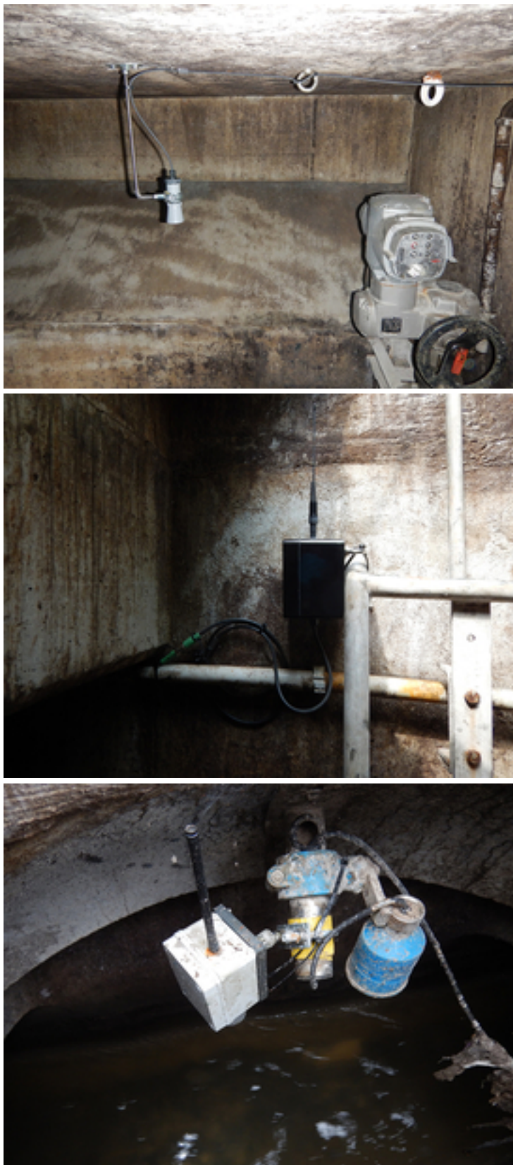
Fig. 2: The wireless sensors transmit spatially and temporally high-resolution measurements of drainage and water levels to the researchers.