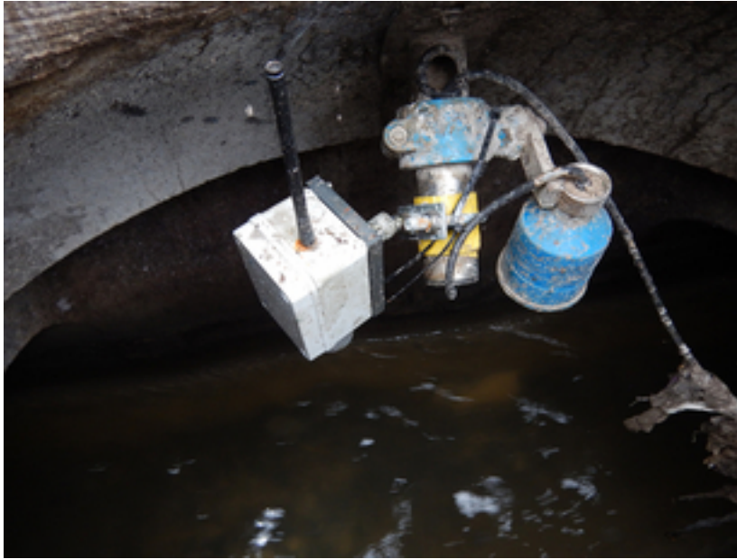
Fig. 2: The wireless sensors transmit spatially and temporally high-resolution measurements of drainage and water levels to the researchers.