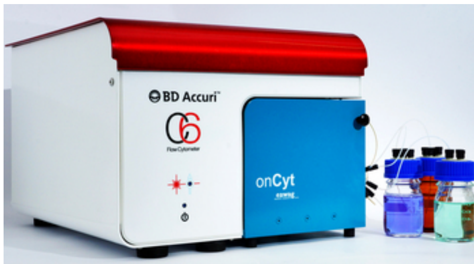
Fig. 2: Fully automated online flow cytometry system containing a conventional flow cytometer (red-white) and the automation module developed by Eawag (blue).

Instead of placing each individual sample into the flow cytometer by hand, a unit coupled to the apparatus now does everything automatically, from sampling to preparation of the sample by staining the DNA/RNA, through to sterilisation of the cytometer. The fully-automated measuring system can now be installed directly in-situ, such as at a water source or a water treatment plant. From there it can transmit temporally high-resolution data sets of the bacterial concentrations over a period of several months. This new method makes available unprecedented amounts of data – tens of thousands of measurements – on microbiological water quality.