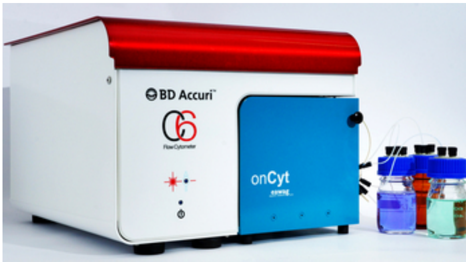
Fig. 2: Fully automated online flow cytometry system containing a conventional flow cytometer (red-white) and the automation module developed by Eawag (blue).

Instead of placing each individual sample into the flow cytometer by hand, a unit coupled to the apparatus now does everything automatically, from sampling to preparation of the sample by staining the DNA/RNA, through to sterilisation of the cytometer. The fully-automated measuring system can now be installed directly in-situ, such as at a water source or a water treatment plant. From there it can transmit temporally high-resolution data sets of the bacterial concentrations over a period of several months. This new method makes available unprecedented amounts of data – tens of thousands of measurements – on microbiological water quality.