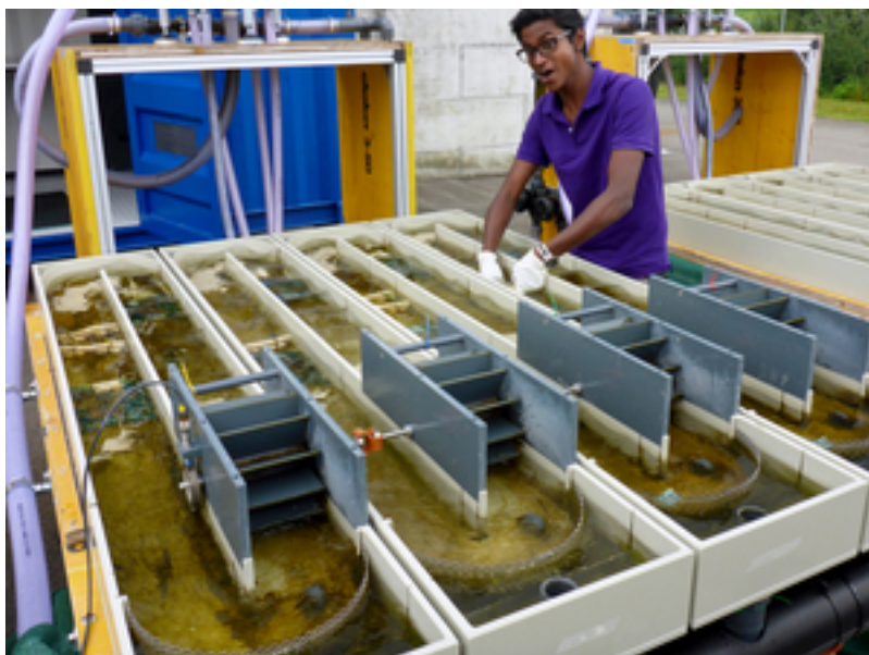
Fig. 4: A 16-channel flume system was used to study the effects of different constituents of wastewater.